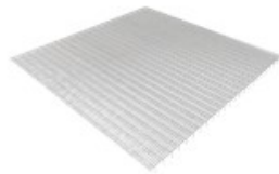
Entrance Mats + Grilles