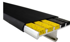
Stair Tread Nosings